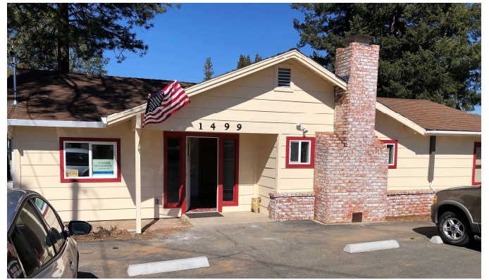
Our New Library, March 14, 2022.